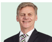
THE RIGHT HONOURABLE SIMON WILLIAM (BILL) ENGLISH KNZM

None of these directors participated in the Board's deliberations with respect to their recommendation for re-election or election.